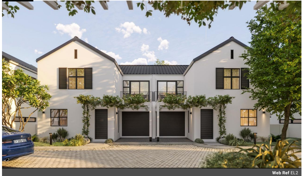
Web Ref EL2