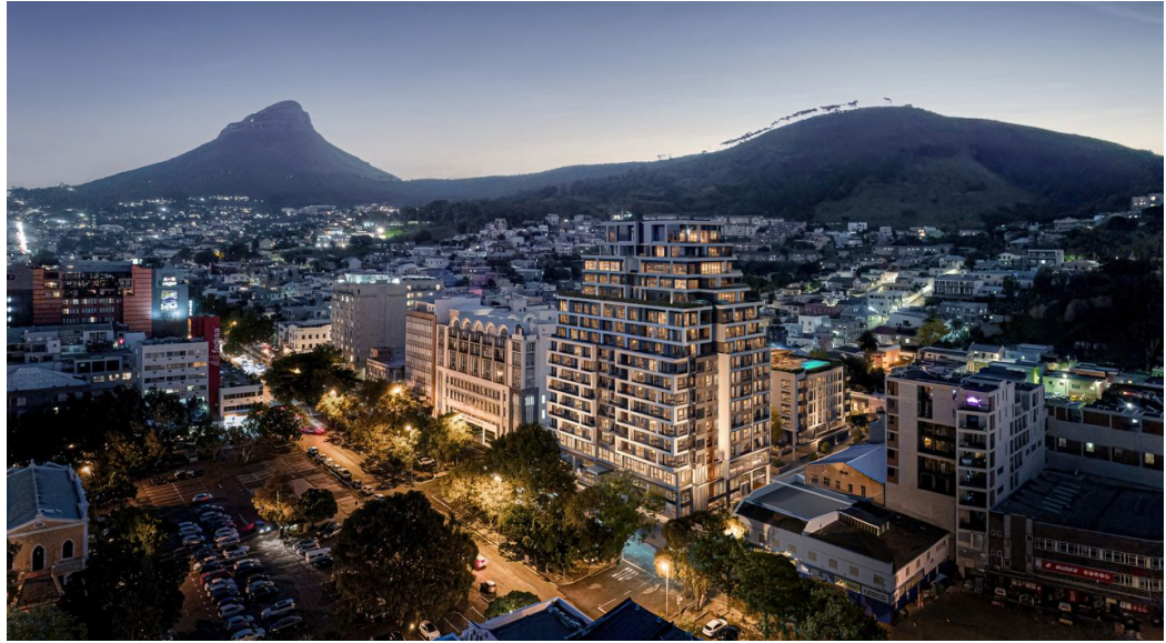
Web Ref ND12