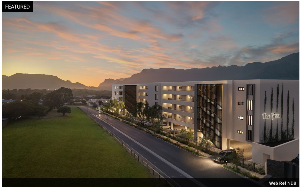
Web Ref ND8