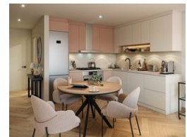
Web Ref ND11