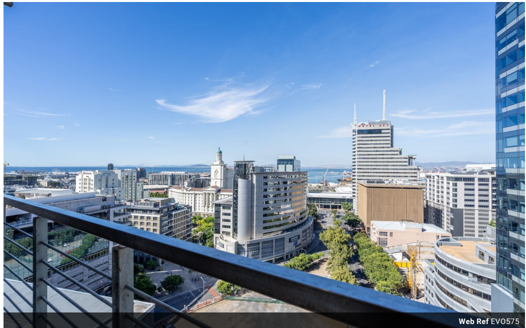
Web Ref EV0575