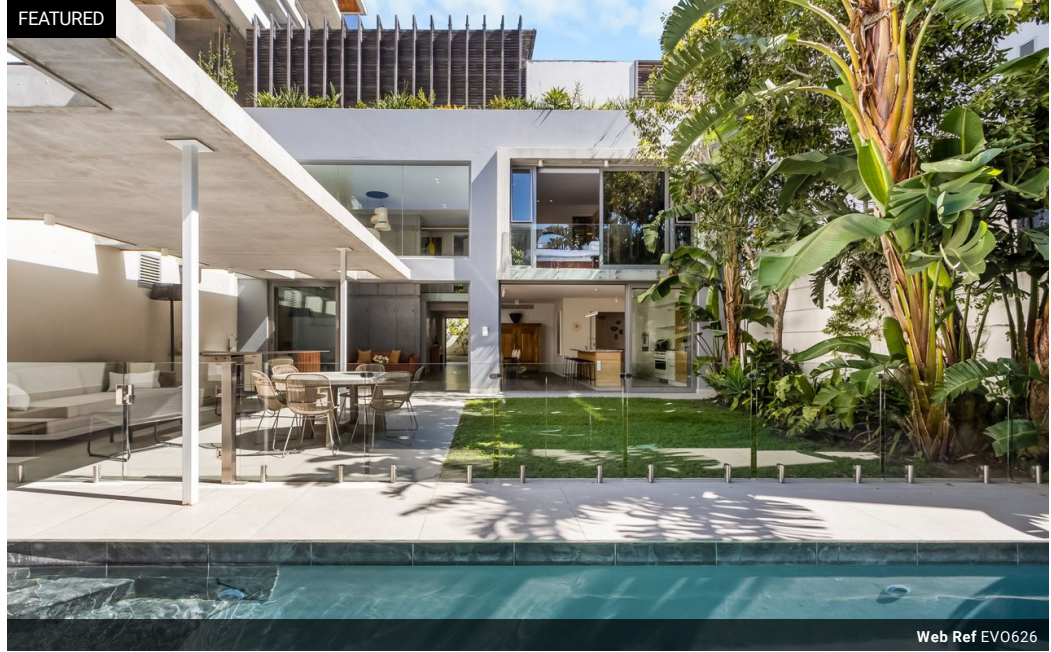
Web Ref EV0626