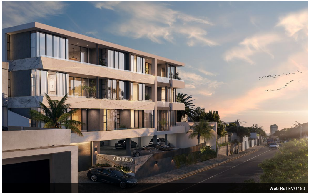
Web Ref EVO450