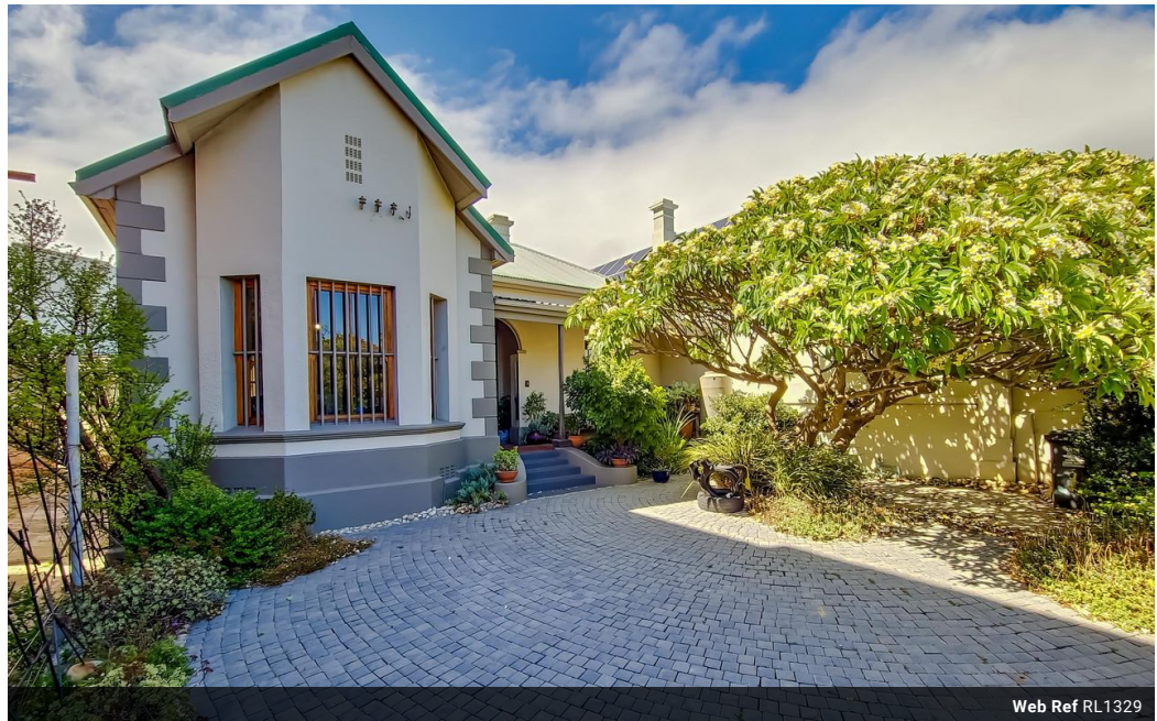
Web Ref RL1329