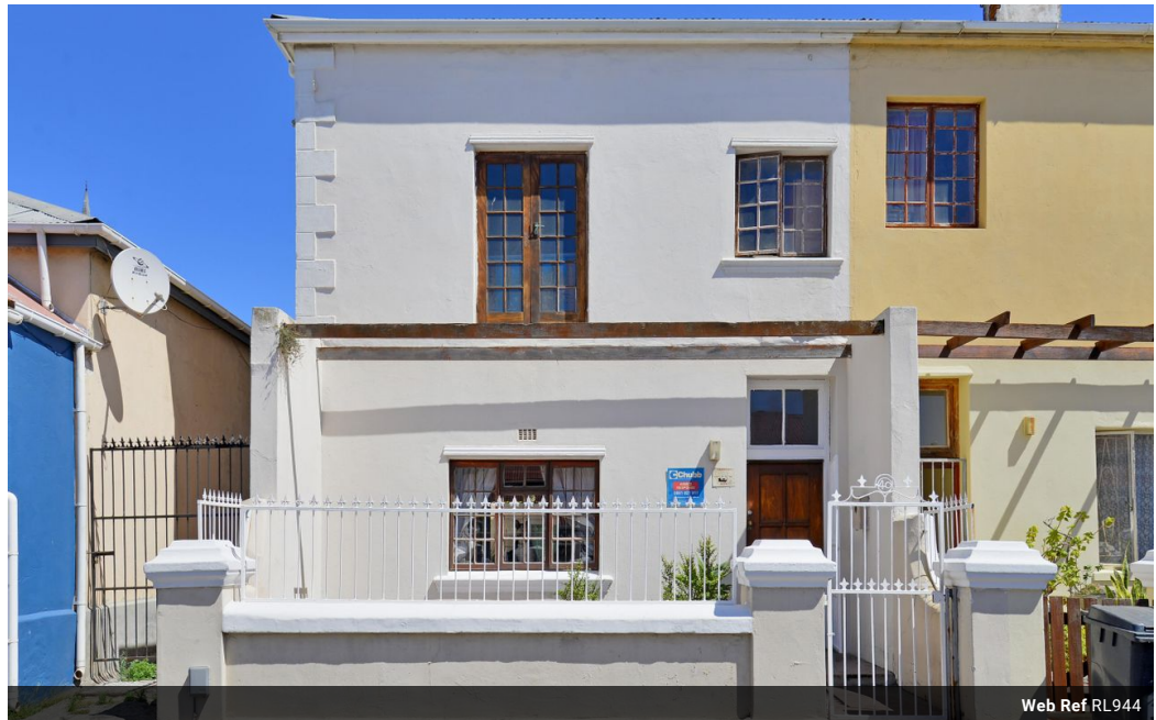
Web Ref RL944