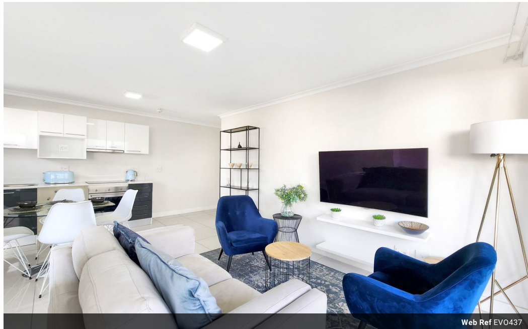
Web Ref EV0437