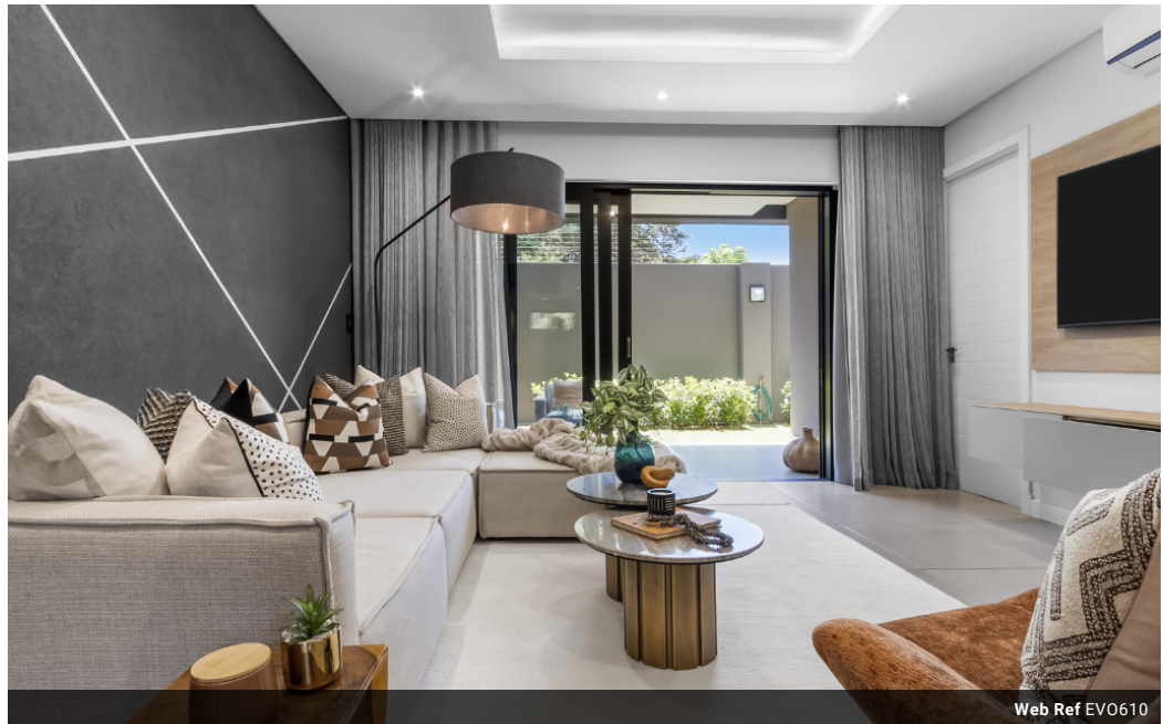
Web Ref EV0610