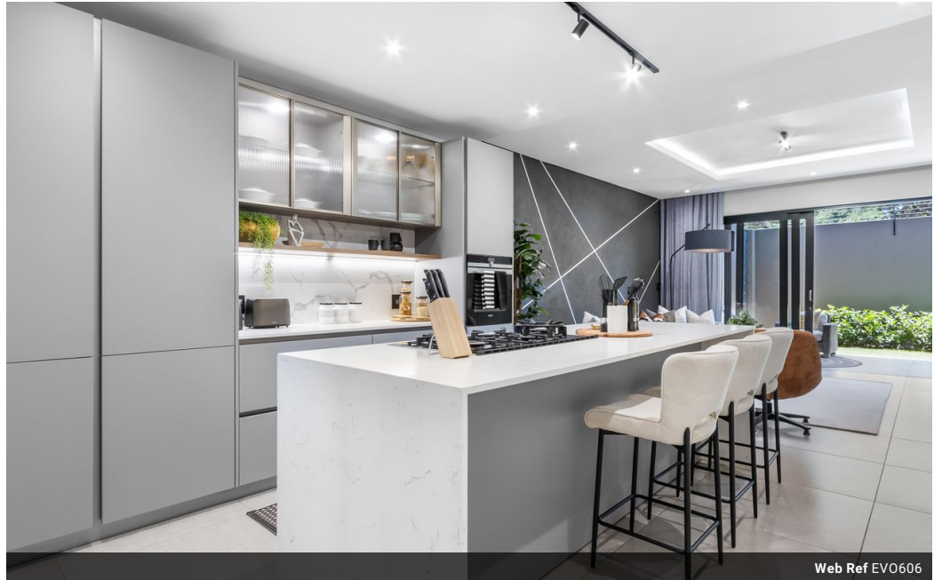
Web Ref EV0606