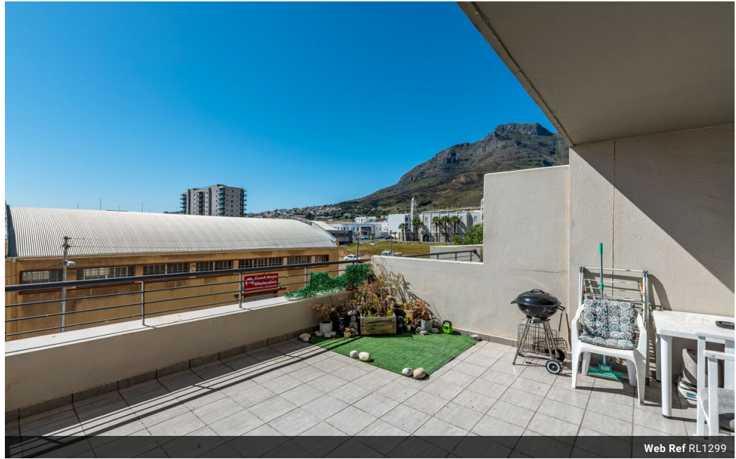
Web Ref RL1299