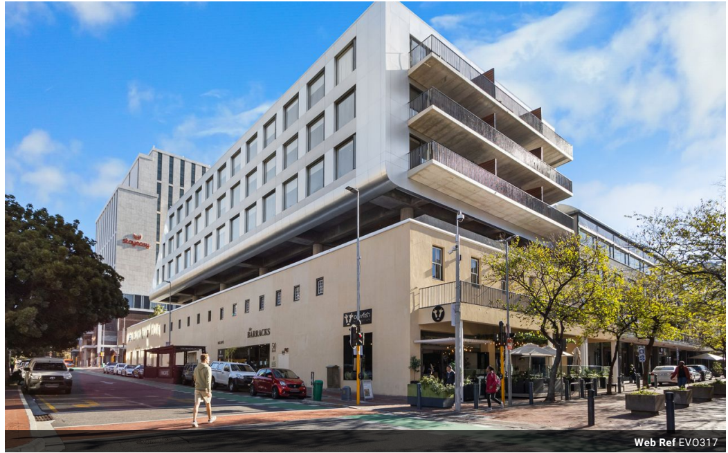
Web Ref EV0317